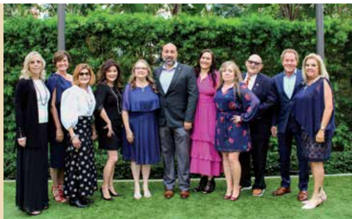
California Youth Services Board of Directors

Because good news is even better when we're part of it!