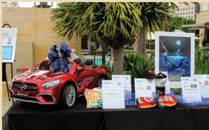
Fun raffle prizes from donors, In-n-Out, Fletcher Jones Newport and Wyland Foundation from last year's gala