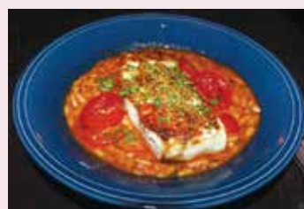
Seared Halibut with golden crust.